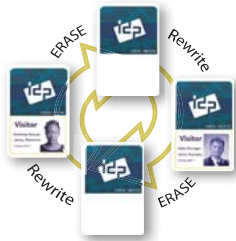
Provides a cost effective solution!

SOLID-310 Rewritable printer is an ideal solution for printing temporary information on ID cards.