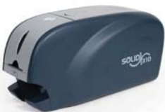
Single sided ID CARD PRINTER SOLID-310S