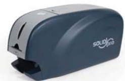
Rewritable ID CARD PRINTER SOLID-310R

SOLID series can encrypt data transmitted on USB and can support SSL pSecure Socket Layerp protocol on ethernet communications.