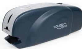
Dual sided ID CARD PRINTER SOLID-310D